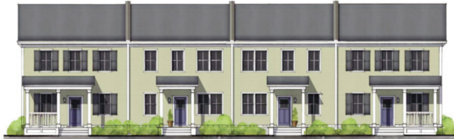
The Storrs I

1,058 square feet 2 bedrooms, 2.5 baths, 1-car garage